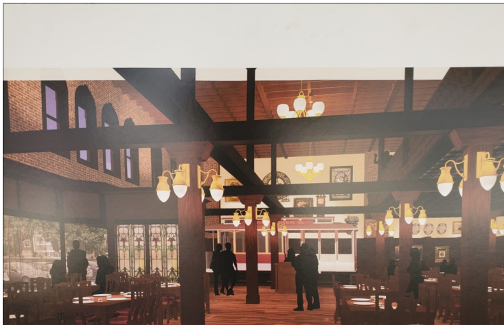
Interior Concept Rendering